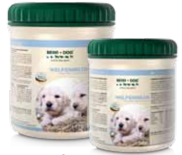
puppy milk 0,5 kg, 2,5 kg